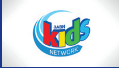
Christian television for kids